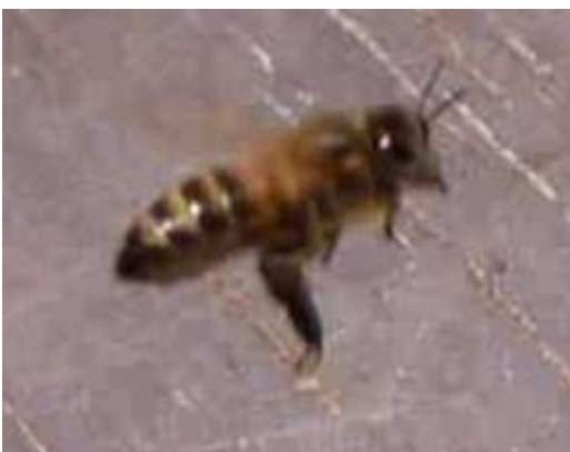
Image motion gives honey bees distance cues

This interesting piece of research adds considerably to our knowledge of how bees judge distance when dancing.